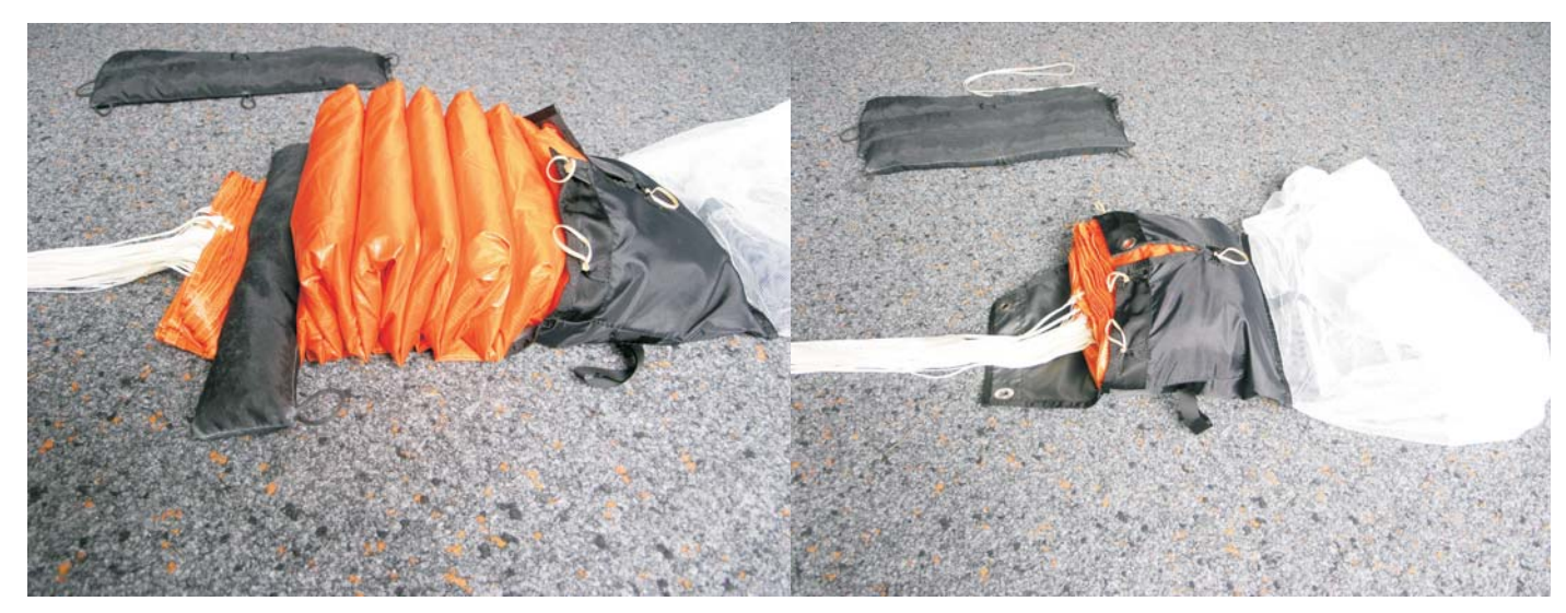
11. Fold the rest of the canopy in small S-folds and place it 12. Put the S-folded canopy in the deployment bag. in front of the deployment bag.