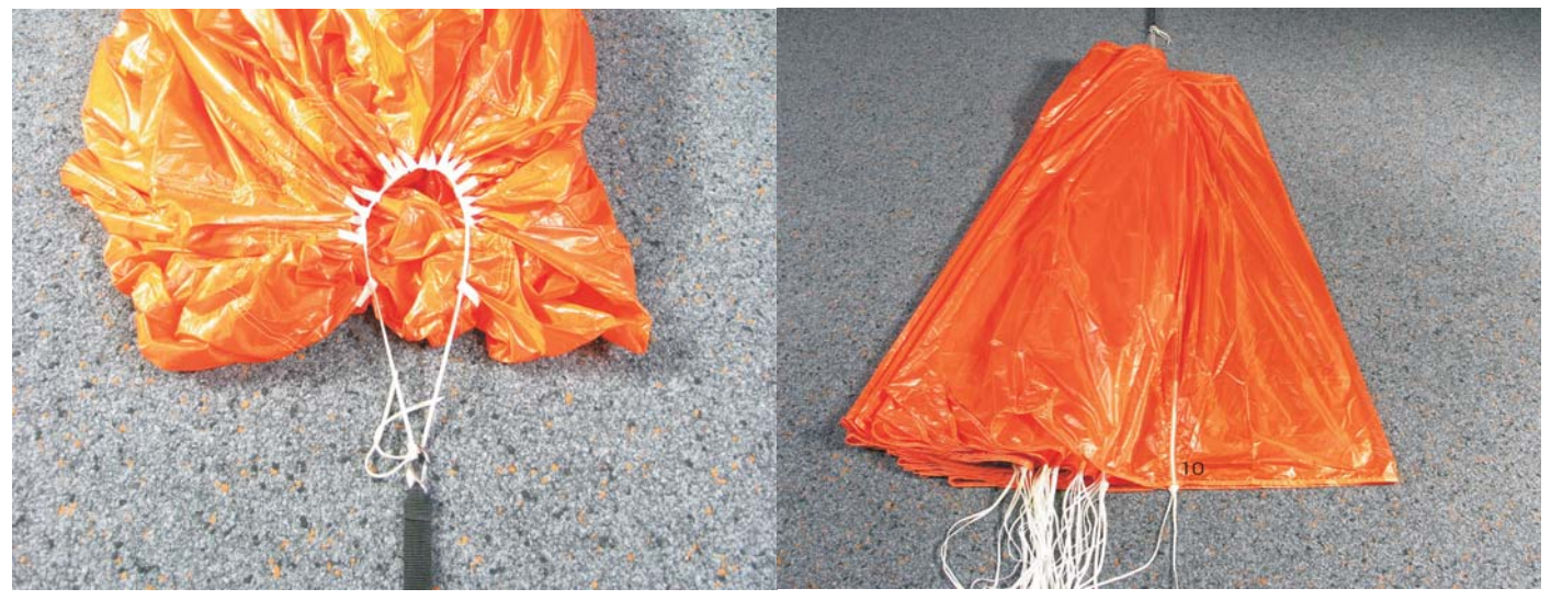
1. Slide on the packing-loops on a line (packing cord), and hook it in.