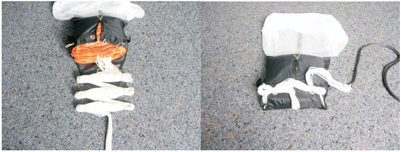
13. Bundle the lines in 3x3 "8-shapes". Do not bundle the last 60cm of the lines.