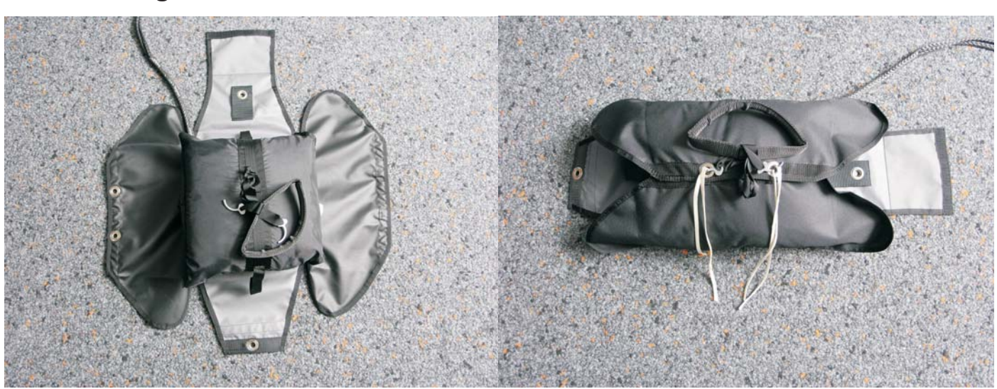
1. Connect the release handle at the loop in the middle of the 2. Close the two lateral flaps of the outercontainer with two deployment bag. Place the bridle at the side of the container packing-cords and closed it with the pins of the handle which you prefer.