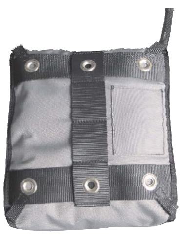
Backside of the outercontainer, with attachment-points