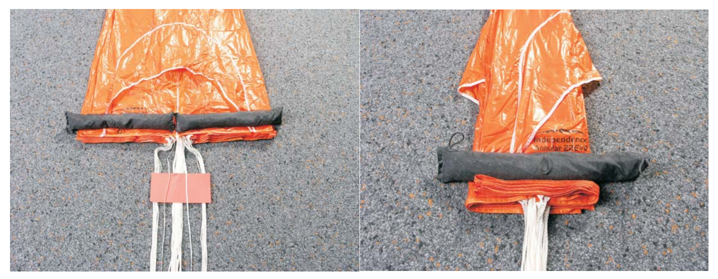
7. Check that line 1 and 20 (Annular EVO 20) and the center line are not twisted and running free. (Annular EVO 22/22HG: 1 and 22; Annular EVO 24/24HG: 1 and 24; Annular EVO Tandem/Tandem HG: 1 and 30)