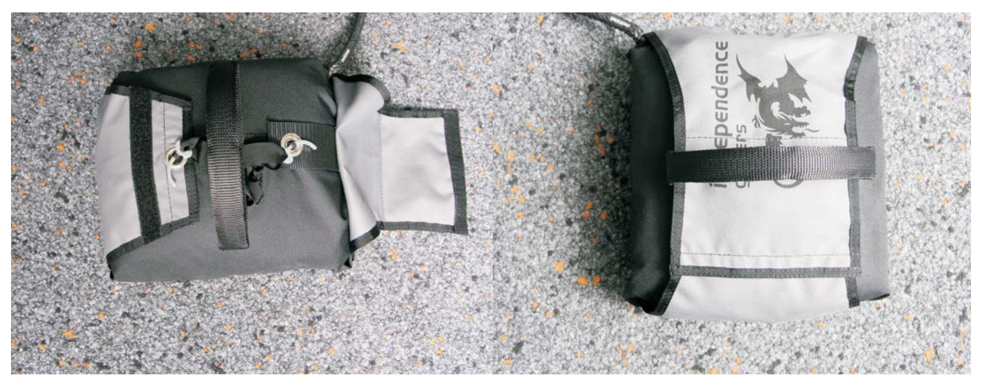
3. Close the upper and lower flap with the pins. Remove the packing cords then!