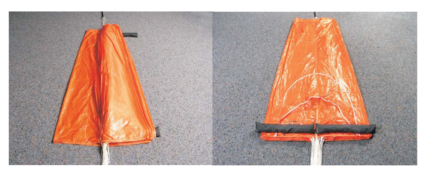
5. Now fold all gores of the left side.