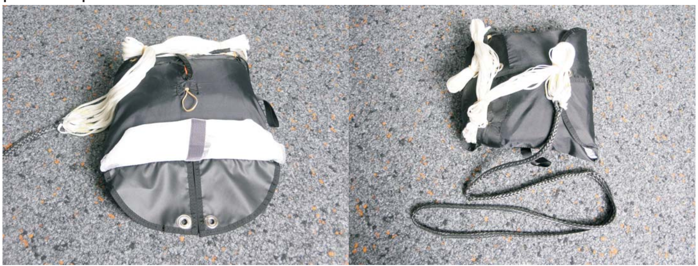
15. Roll in the drogue chute.