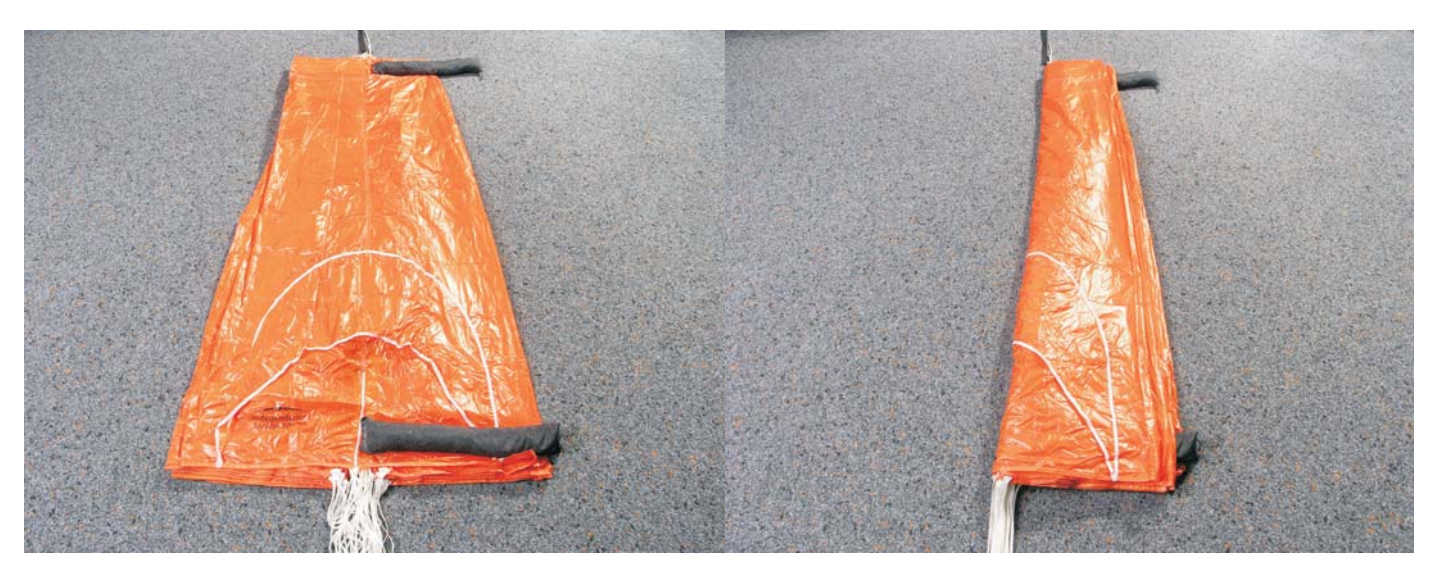
3. Lay all gores to the right, until gore 1 (stamped gore) is on 4. Fold the left side onto the right side. the top, then put a weight (sand bag) on it.