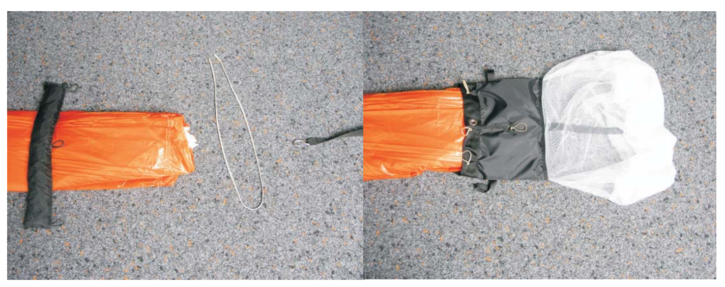
9. Remove the packing cord!